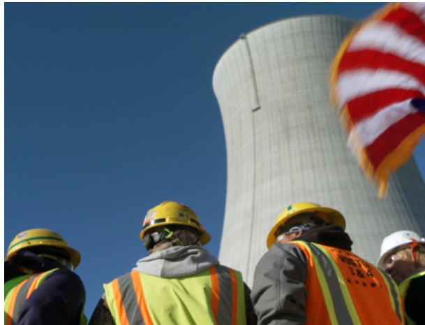
New nuclear jobs are far in the future and likely far fewer than promised.

Fantasy figures: SMNRs will be manufactured in factories elsewhere and only assembled on site. The job figures will be far lower than SMR publicity suggests and mostly short-term.