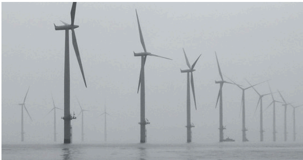
Wind and solar are already “modular”

Modular means that a group of small reactors at a single site could variably come on and off the grid as demand dictates. But the cost of this load flexibility would be far higher than the cost per kilowatt of electricity produced by factory-produced solar and multi-turbine wind farms, which are already modular, are not inherently dangerous like reactors and produce no lethal long-lasting waste.